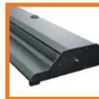
Aluminum Base (Black or Silver)