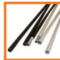
Easy install pole

*Customised height available upon request