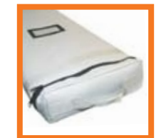
Padded carry bag included