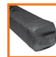
Padded carry bag included