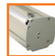
Aluminum Base (Black or Silver)