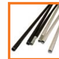
Easy install pole

*Customised height available upon request